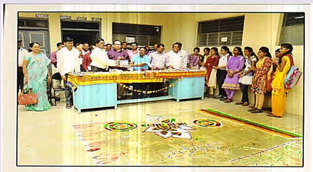
Celebration of Vachan Prerna Din